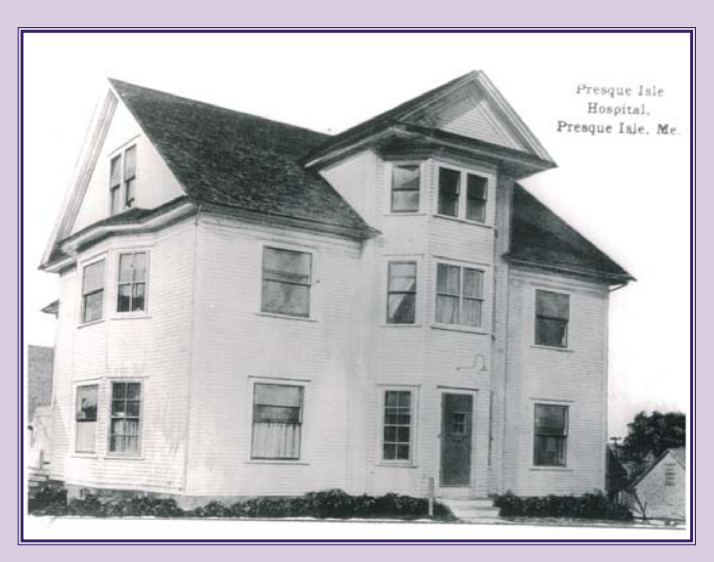
Presque Isle's first hospital, on Second Street next to what is now City Hall. The hospital opened on April 8, 1912. During its first year of operation, the hospital served 359 patients. The hospital, now The Aroostook Medical Center, is celebrating its 100th anniversary this year.

Although Maine had quite a few hospitals by the early 1900s, most were housed in cottages on the main streets of small towns. With only a few beds and limited equipment, the expectation was that only the sickest patients would be admitted and only as a last resort. Everyone else would stay home, send for the doctor, and, if the illness were severe, hire a round-the-clock nurse.