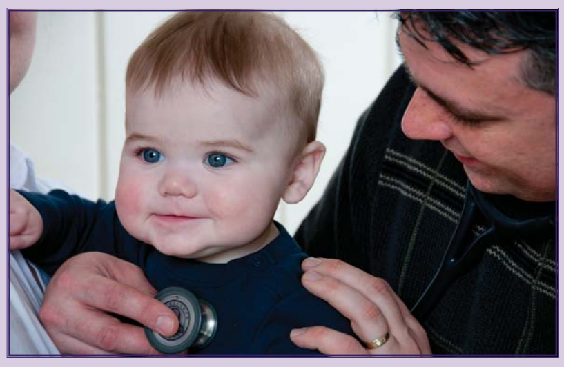
A young patient at the Donald S. Walker Health Center in Liberty, part of Waldo County General Hospital.

One thing is clear: No matter what the future holds, the Maine Hospital Association will continue to be a voice for hospitals, allowing them to continue to care for their communities.