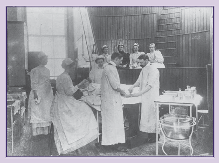
The surgical ward at Maine General Hospital in Portland, circa 1895.

As early as 1913, the Maine Legislature enacted laws to regulate charity care. In 1917, many hospitals in the state were given a lump sum for "Care, Support and Medical or Surgical Treatment of Indigent Persons." Bath City Hospital received $2,250; Bar Harbor Hospital, $2,000; Augusta General, $6,500; and York Hospital, $1,200. The law stipulated that hospitals had to secure additional funds from municipalities or private donations to remain eligible for state aid.