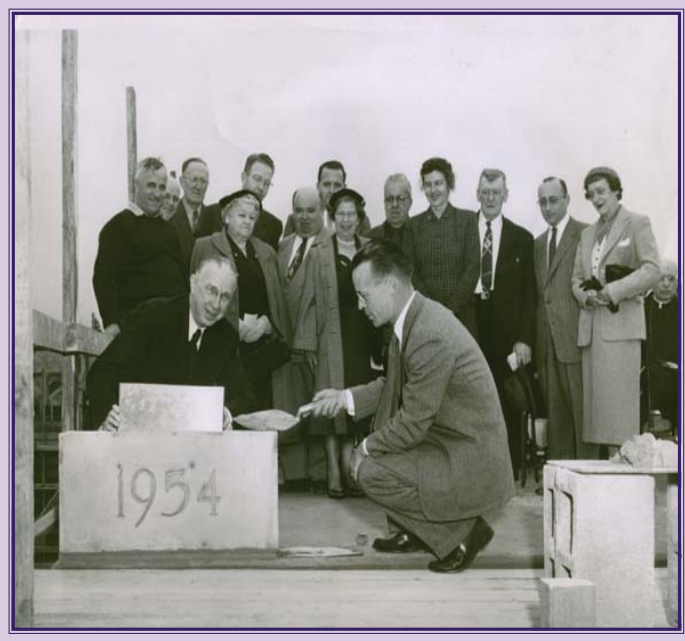
Setting the cornerstone at Calais Regional Hospital in 1954.

By 1959, MHA leaders realized that hospital complexity was making it difficult to stay on top of legislative action. With the continuing increase in hospital costs, state aid had slipped to paying only 35 percent of actual costs.