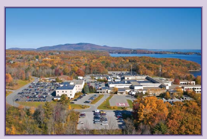
Pen Bay Medical Center in 2007

Hospital quality was also a theme in the 2000s. With the publication of "To Err is Human," the Institute of Medicine's seminal report that raised awareness of medical errors, both the federal and state governments became more active in ensuring that hospitals provided high-quality care and pushed for public reporting of quality data. Maine hospitals,