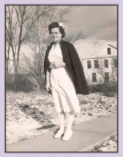
AWaldo County General Hospital nursing graduate, 1941.

By the end of 1941, attention would shift from local charity care problems to more global concerns. Two days after the Japanese attacked Pearl Harbor, MHA received a terse telegram from Washington, D.C., Civil Defense Headquarters. The message? To immediately establish medical field units that would hold weekly drills. Reserve nursing and medical staff were to be organized, community volunteers would be used where necessary. The nation was at war.