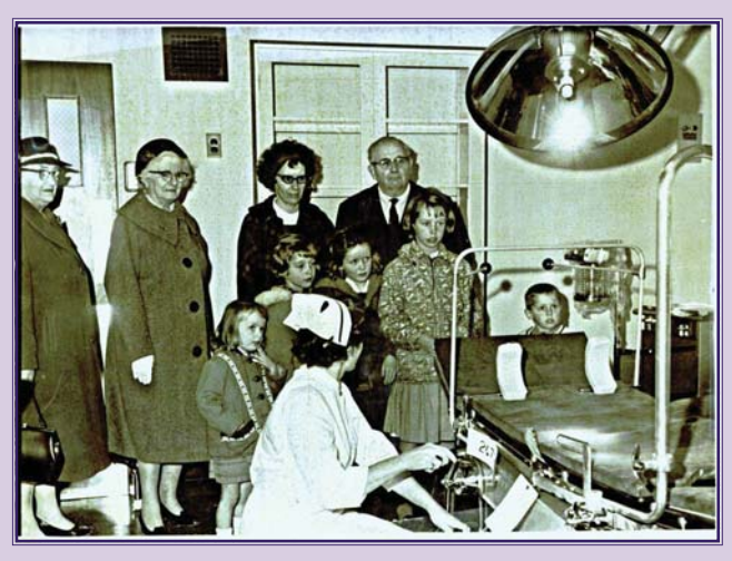
Down East Community Hospital community tour, 1964.

Although these government plans would ease one burden, they would spawn an unprecedented set of complex regulations that bound hospitals to the vagaries of politics. Never again would hospitals know the autonomy that they had in the early 1930s.