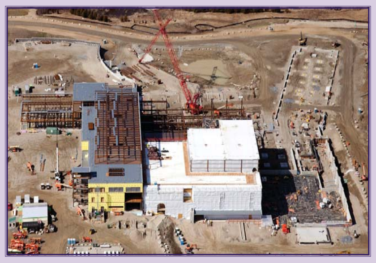
The new MaineGeneral Medical Center under construction. The hospital is scheduled to open in 2014.

However, even if the law is overturned, it seems likely that certain aspects of it, such as value-based purchasing, will remain part of the system. Whether changes in the health insurance system will make private insurance affordable enough for more workers to purchase it is still unknown.