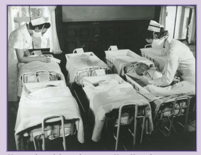
Nurses tending to babies in the nursery at Mercy Hospital

Compared to the Depression and war years, the 1950s were a golden age. Returning soldiers got jobs, got married, had babies. The economy was booming and the middle class was thriving.