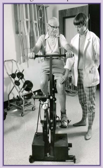
The rehab facility at Webber Hospital, now Southern Maine Medical Center, in the 1980s.

The 1980s also saw the first tentative steps toward publicly reporting quality data. The Health Care Financing Administration (HCFA) started issuing mortality statistics in 1986. MHA embarked on a public relations campaign to explain why mortality data wasn't a good way to measure hospital quality.