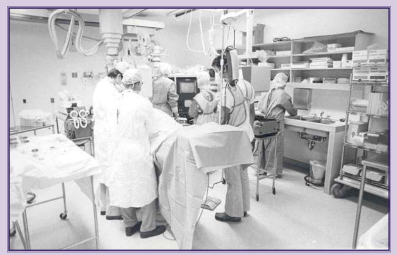
Surgery at Eastern Maine Medical Center, 1974.

the Association developed a Cost Containment Program to gather and disseminate ideas for holding down hospital costs.