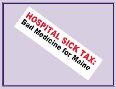
Bumper stickers, like the one above, were part of MHA's legislative campaign against Tax & Match.

The 1990s began with one of the deepest recessions in history, hitting state government coffers and thus the Medicaid program. In fact, 1991 was highlighted with the first, and so far only, state government shutdown, the result of a battle over workers compensation reform between Republican Governor John McKernan and the Democratically controlled Legislature.