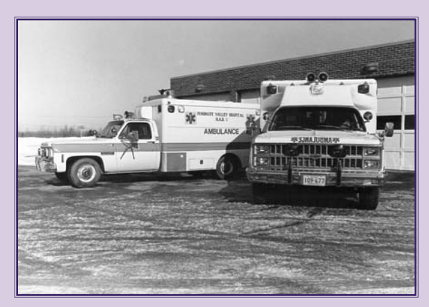
Ambulances outside Penobscot Valley Hospital.

The attacks of September 11 brought home the lesson that unexpected disaster can happen at any time. Hospitals in Maine joined with first responders and other emergency management professionals to work on emergency plans.