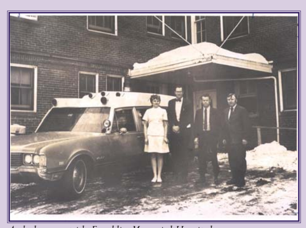
Ambulance outside Franklin Memorial Hospital.

Health care had entered a new era. No longer was it assumed to be the privilege of status. Many now believed health care was now a universal right .