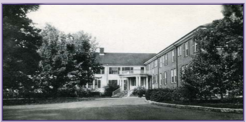
Mount Desert Island Hospital before 1961.

Health care had entered a new era. No longer was it assumed to be the privilege of status. Many now believed health care was now a universal right .