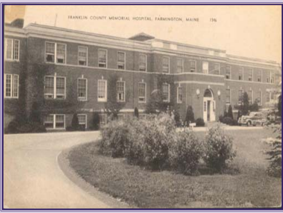
Franklin County Memorial Hospital, 1946.

And indigent care had become an emergency situation. Because smaller hospitals had few options for private endowments, most indigent care had become the burden of the large hospitals.